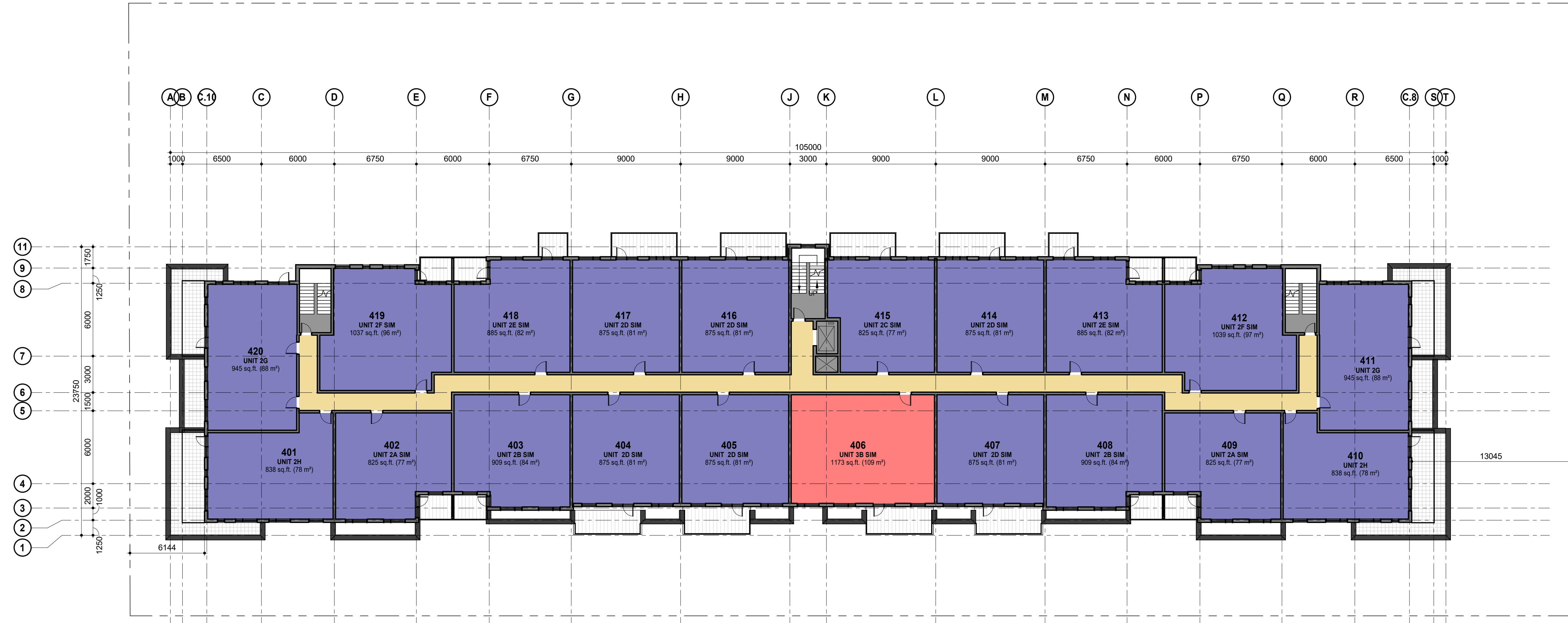
1 LEVEL 400 1:200