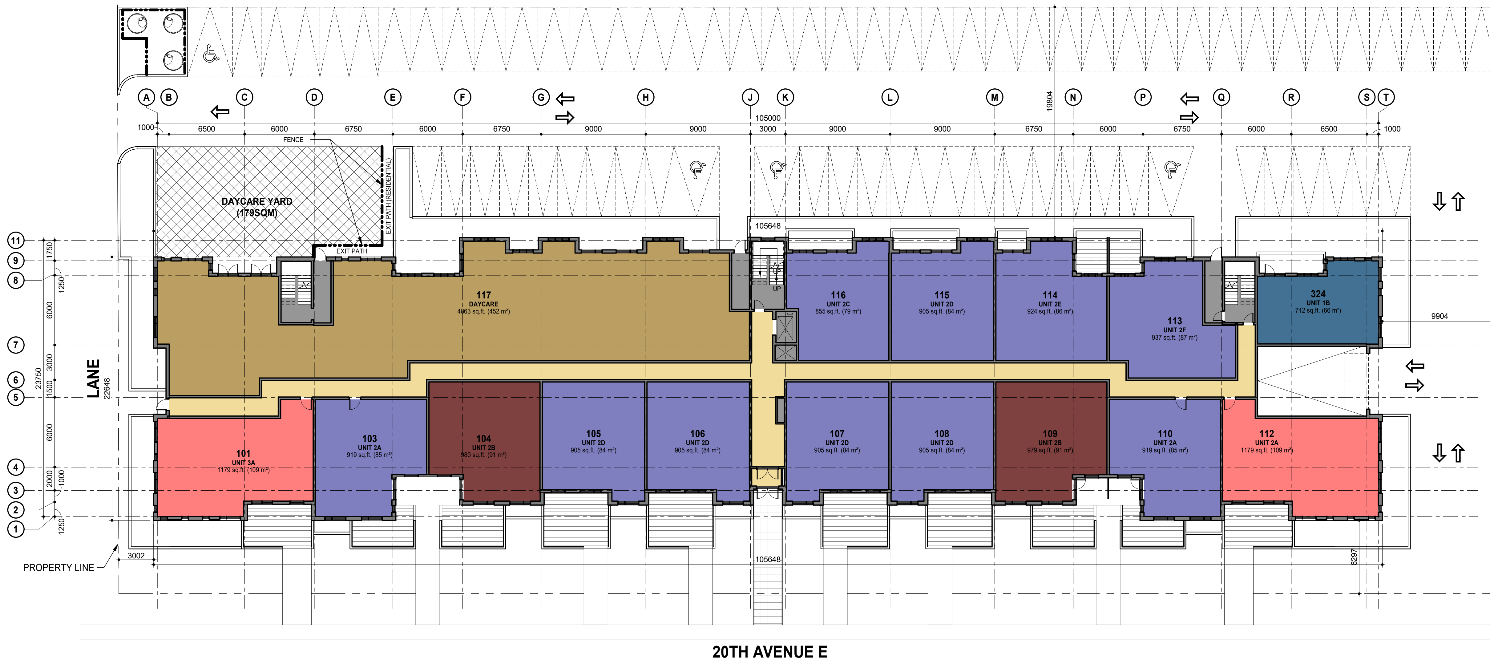
2 LEVEL 100 1:200