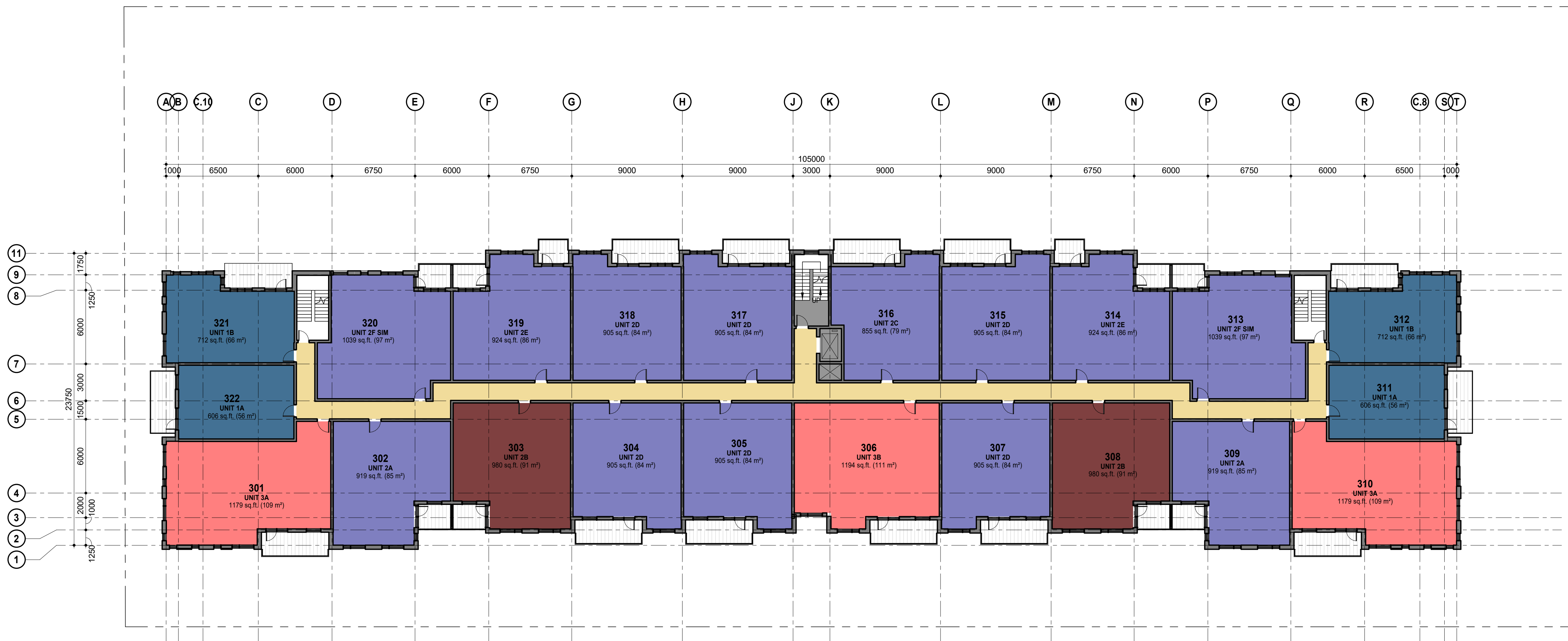
2 LEVEL 300 1:200